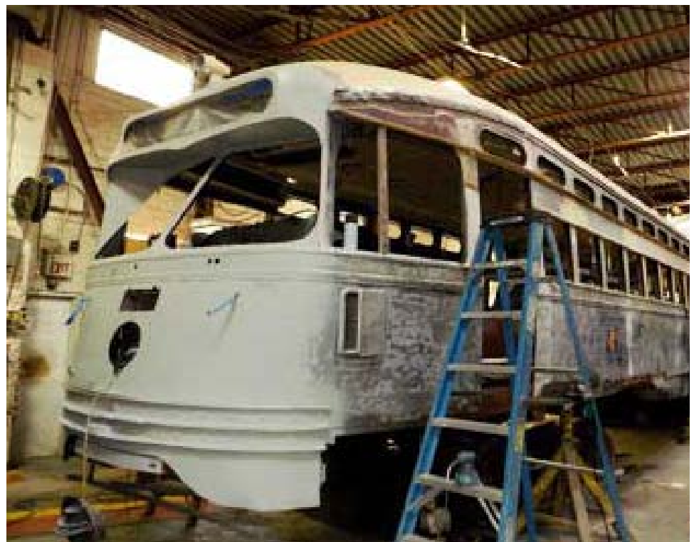
MATA begins rebuilding Car 4616.

The car has a unique and interesting service history north of the border. It's one of only 50 of its kind built by St.